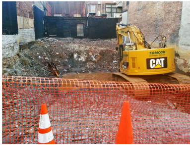
424 West 55th Street

The structure will be unfortunately stout for its location, just a few blocks from the booming 57th Street