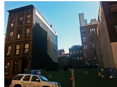
424 West 55th Street