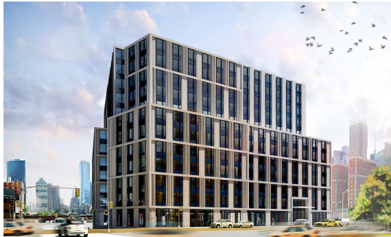
411 West 35th Street. Rendering by Workshop + Design Architecture.

Amenities include an 80-car underground parking garage, storage for 94 bikes, laundry facilities, an outdoor recreational area on the ground floor, a rooftop terrace, and many other “recreation” and “parcel” rooms (probably consisting of lounges, a fitness center, etc.). YYY Development & Construction is the developer. Gowanus-based Workshop Design + Architecture is the design architect, while Aufgang Architects is serving as executive architect . Completion is expected in early 2017.